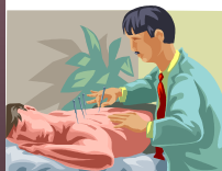
Recent studies conclude effectiveness of acupuncture for infertility.