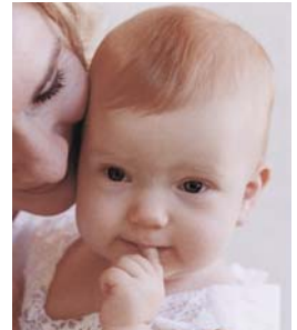
Continuous improvement in patient care is No.1 at SDFC.